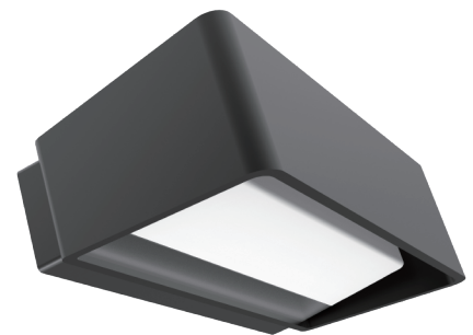
TOPA0001 (Dark grey)