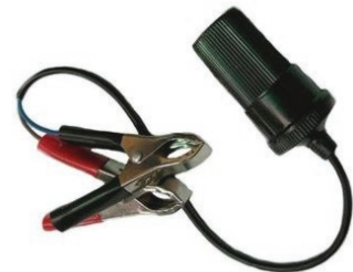
TOO-1 (Battery Adaptor)