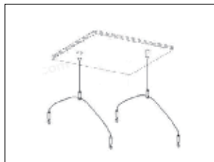
1. T-bar ceiling