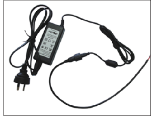
▲ 12V DRIVER WITH FLEX & PLUG AND OUTPUT LEAD

NOTE: ensure individual strip does not exceed recommended length