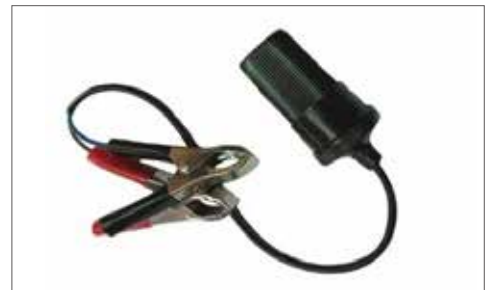
▲ TOO-1 BATTERY ADAPTOR